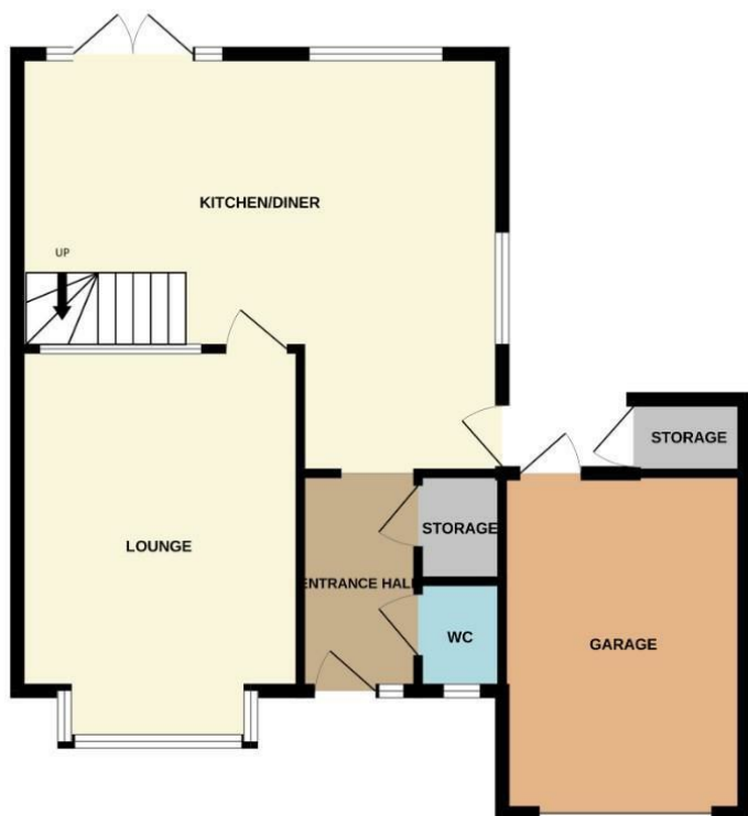
GROUND FLOOR 691 sq.ft. (64.2 sq.m.) approx.